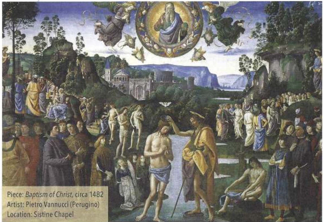
Piece: Baptism of Christ , circa 1482 Artist: Pietro Vannucci (Perugino) Location: Sistine Chapel

At our baptism, we were sanctified, forgiven our sins, incorporated into the body of Christ, and given