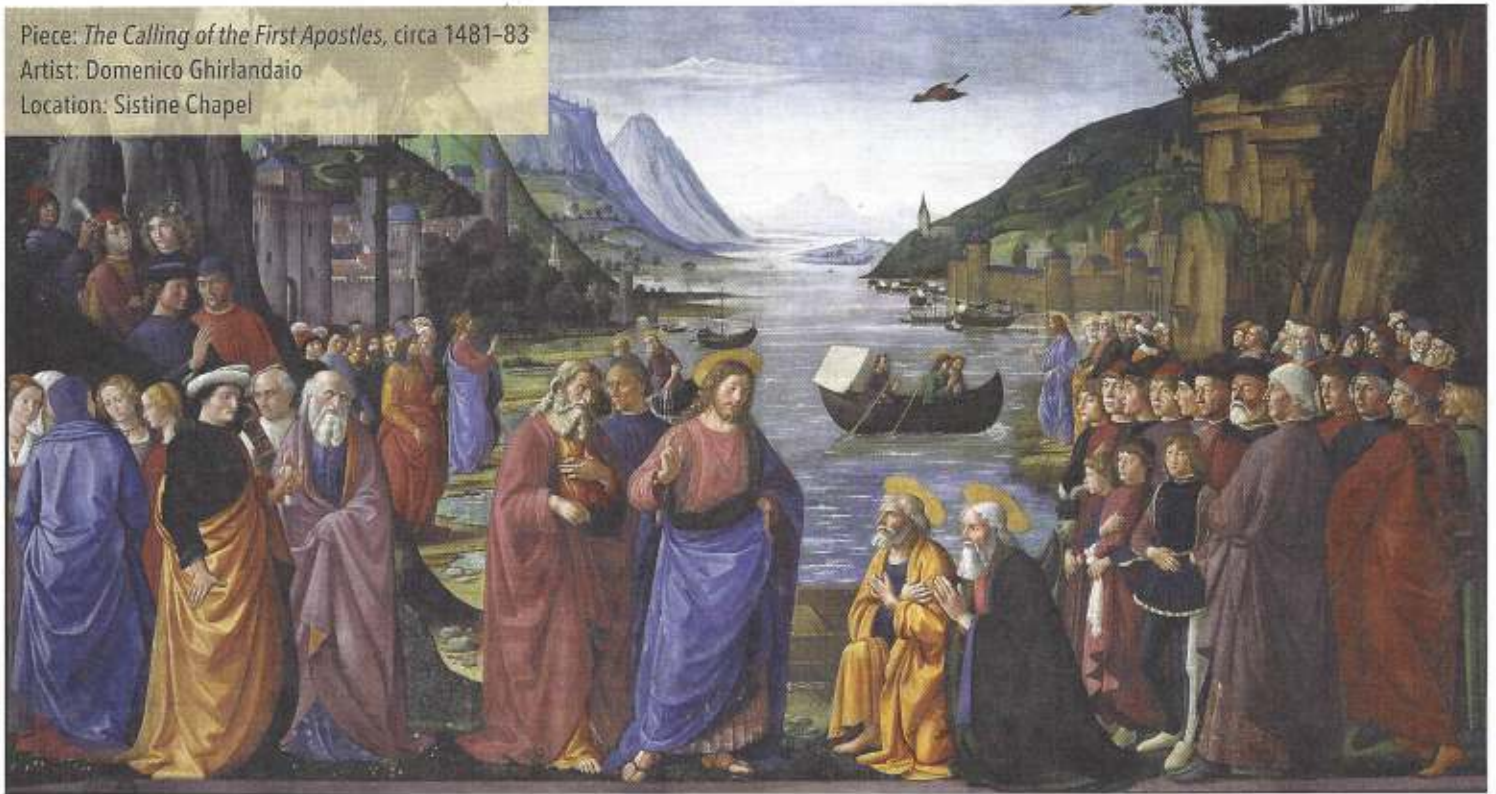
Piece: The Calling of the First Apostles , circa 1481–83 Artist: Domenico Ghirlandaio Location: Sistine Chapel