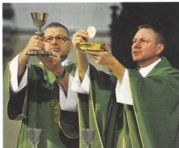
DEACON, AT LEFT

Deacons are vital to the life of the Church. Many permanent deacons have families and full-time jobs in addition to their Church work. We don't thank deacons and their families enough for the many sacrifices they make for the people of God.