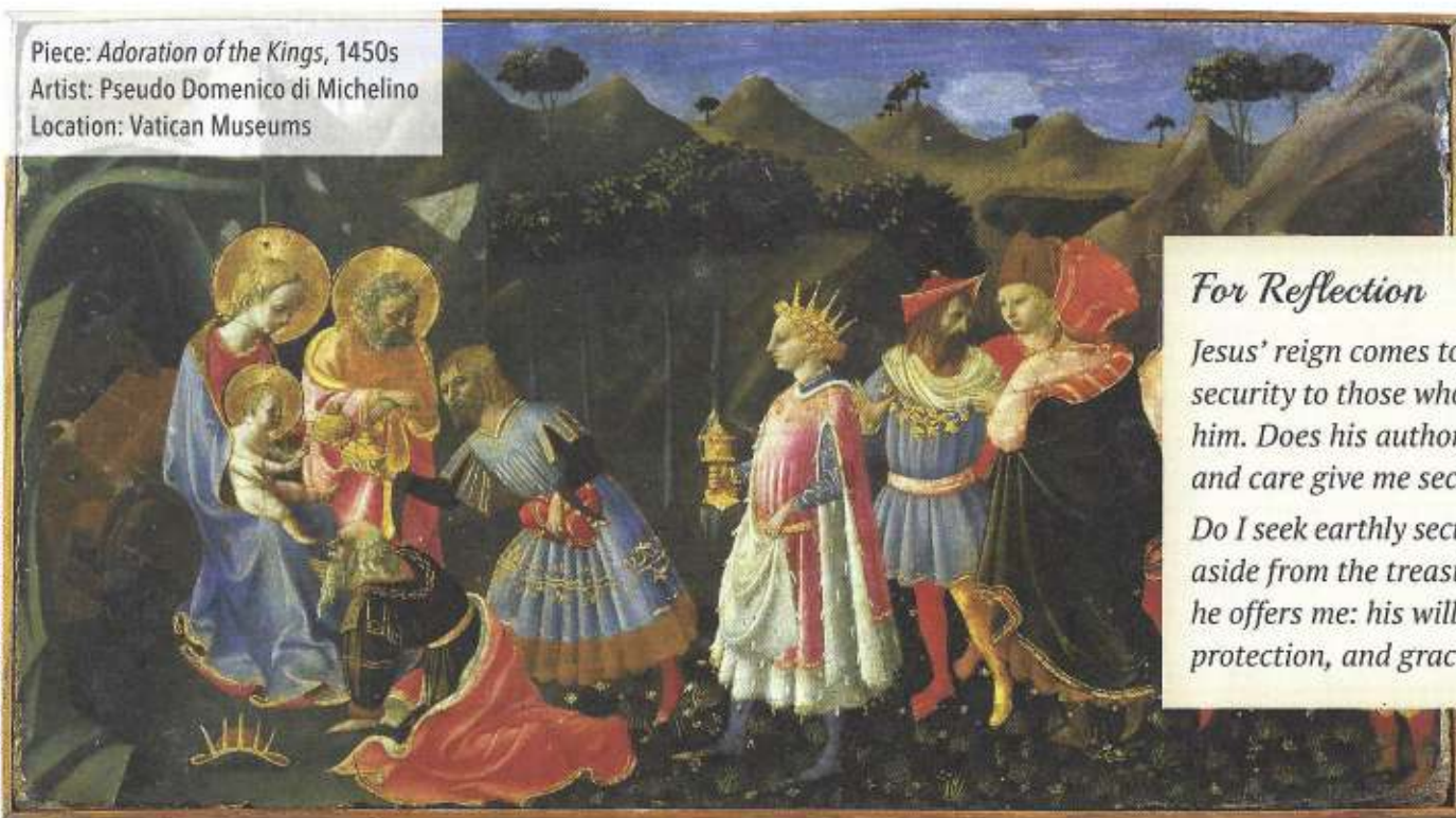
Piece: Adoration of the Kings , 1450s Artist: Pseudo Domenico di Michelino Location: Vatican Museums