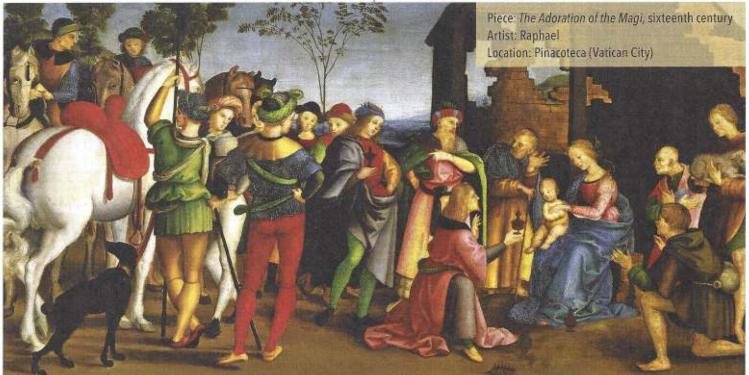
Piece: The Adoration of the Magi , sixteenth century Artist: Raphael Location: Pinacoteca (Vatican City)

Am I willing to humbly accept Jesus for who he is: the Son of God? From what must I detach myself in order to accept Jesus more fully?