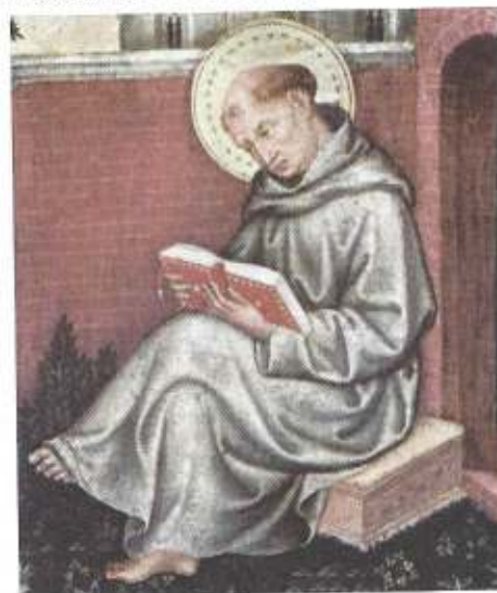
DETAIL: THOMAS AQUINAS FROM VALLE ROMANA POLYPYCH BY GENITILE DA FABIANO (C.1400) WIKIPEDIA