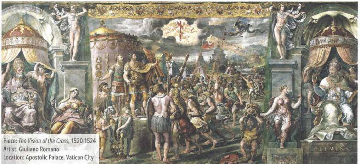
Piece: The Vision of the Cross , 1520-1524 Artist: Giuliano Romano Location: Apostolic Palace, Vatican City

Do I give more credence to fads or feel-good philosophies than to the truth revealed by Jesus?