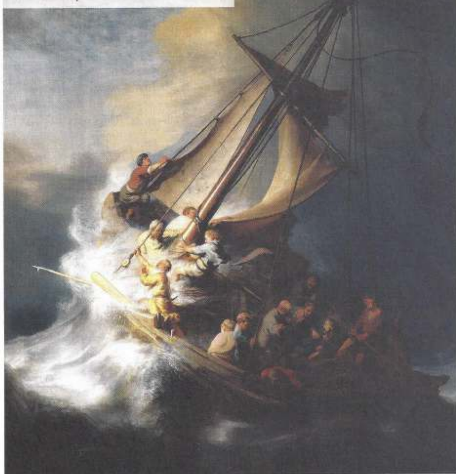
Piece: The Storm on the Sea of Galilee , 1632 Artist: Rembrandt van Rijn