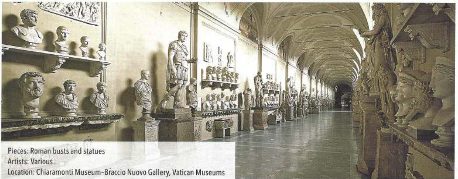
Pieces: Roman busts and statues