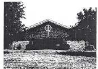
Holy Trinity - Cherry