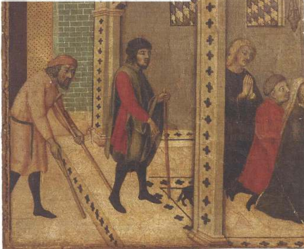
Piece: Scenes from the Legend of St. Peter the Martyr and The Blind and the Lame Pray at the Saint's Tomb (circa 1440) Artist: Sano di Pietro Location: Vatican Museums