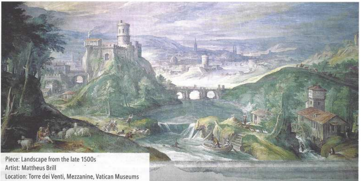
Piece: Landscape from the late 1500s

How does our Lord want to see fruit and growth in your life? Have I squandered God's harvest in my life?