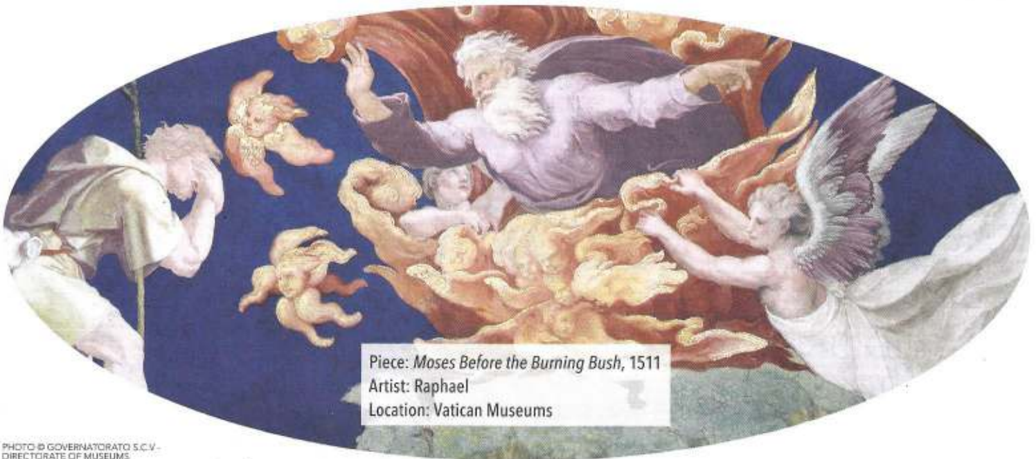
Piece: Moses Before the Burning Bush , 1511 Artist: Raphael Location: Vatican Museums

Do I fully appreciate the implications of the resurrection of the body as an element of my faith?