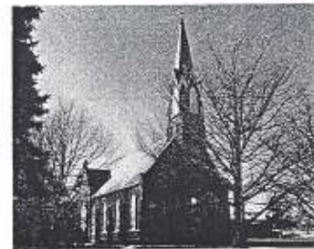
St. Patrick Catholic Church