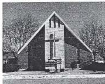
Holy Trinity Catholic Church