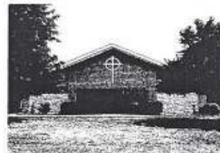
Holy Trinity - Cherry