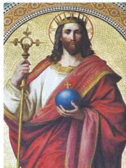
JESUS CHRIST AS KING OF THE WORLD BY KARL VON BLAS, NINETEENTH CENTURY

From Dear Padre: Questions Catholics Ask , © 2003 Liguori Publications