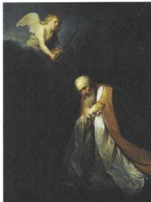
KING DAVID IN PRAYER, PIETER DE GREBBER

From Dear Padre: Questions Catholics Ask , © 2003 Liguori Publications