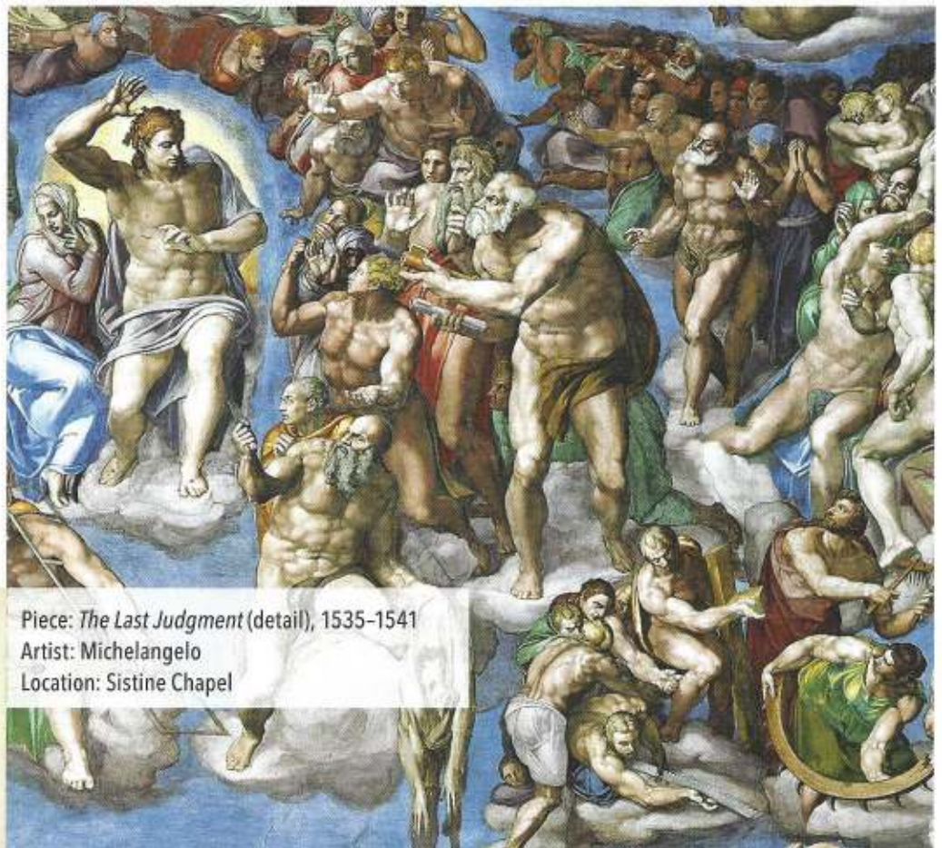
Piece: The Last Judgment (detail), 1535-1541