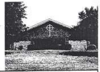
Holy Trinity - Cherry