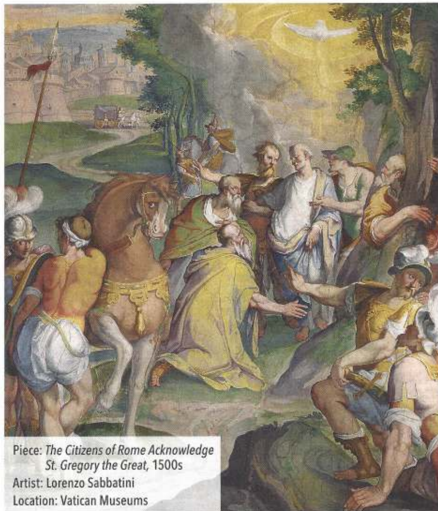
Piece: The Citizens of Rome Acknowledge St. Gregory the Great , 1500s Artist: Lorenzo Sabbatini Location: Vatican Museums

As a parent, am I a priest in my family? Do I lead my children in prayer, teach them the faith, and set a good example of faith and love of God? Do I pray for priests and offer them support and help?