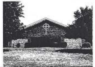
Holy Trinity - Cherry