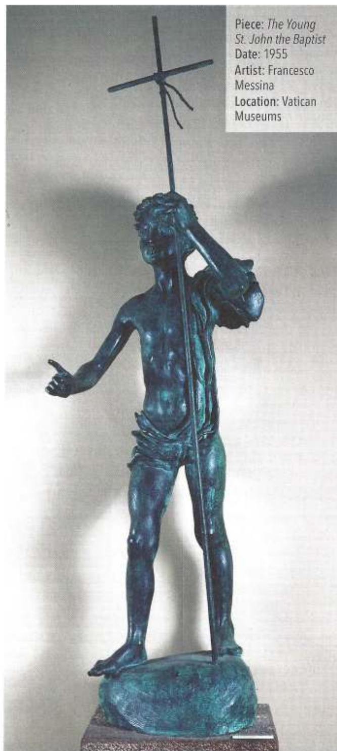
Piece: The Young St. John the Baptist Date: 1955 Artist: Francesco Messina Location: Vatican Museums

Can I give my anxiety to Jesus and ask him to bring me a greater sense of peace this Christmas?