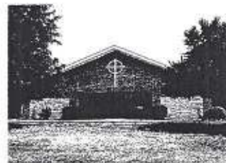
Holy Trinity - Cherry