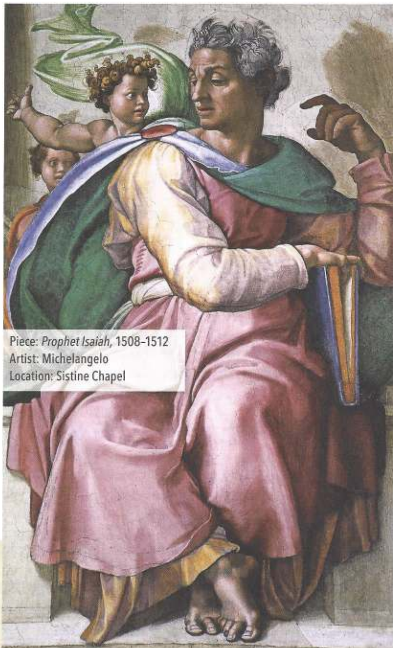
Piece: Prophet Isaiah, 1508-1512