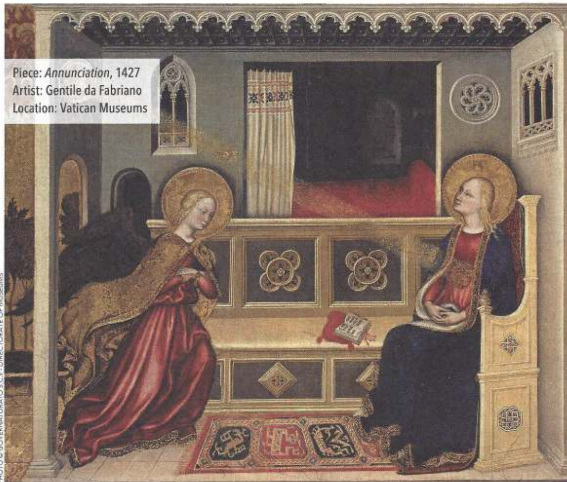
Piece: Annunciation , 1427 Artist: Gentile da Fabriano Location: Vatican Museums