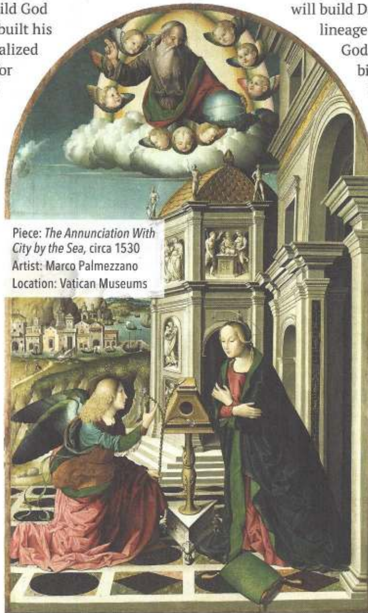
Piece: The Annunciation With City by the Sea , circa 1530 Artist: Marco Palmezzano Location: Vatican Museums

For Reflection God wants to give me more than I ever dreamed of. Is giving myself to him in prayer a way to let him accomplish that dream in me? How can I offer hospitality in my heart, my home, my work and my Church so that others can encounter God's love?