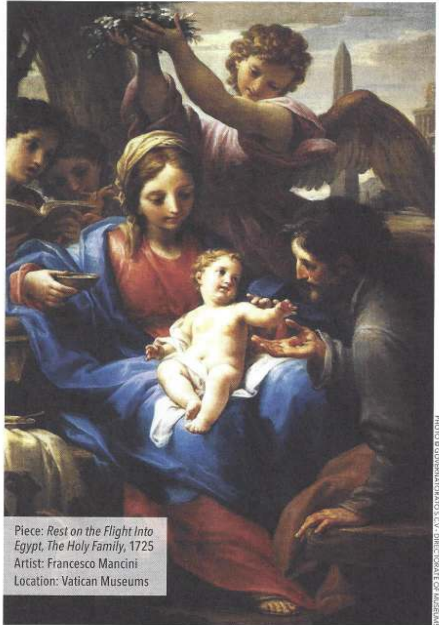
Piece: Rest on the Flight into Egypt, The Holy Family , 1725 Artist: Francesco Mancini Location: Vatican Museums