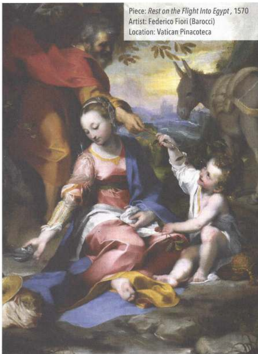
Piece: Rest on the Flight into Egypt , 1570 Artist: Federico Fiori (Barocci) Location: Vatican Pinacoteca