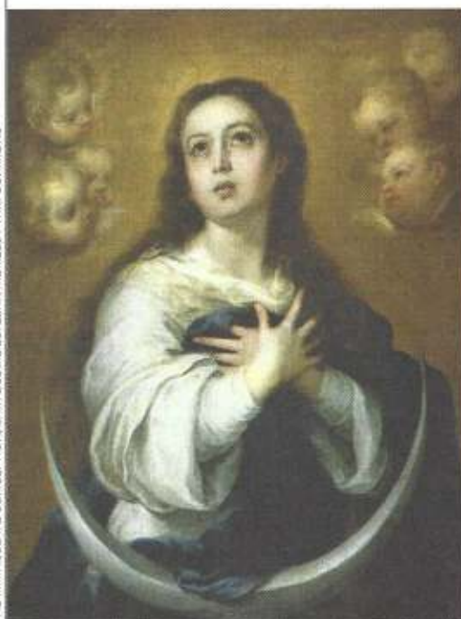
THE IMMACULATE CONCEPTION, BARTOLOMÉ ESTEBAN MURILLO