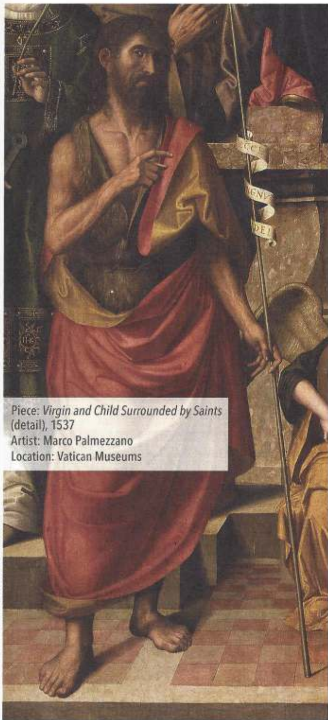
Piece: Virgin and Child Surrounded by Saints (detail), 1537