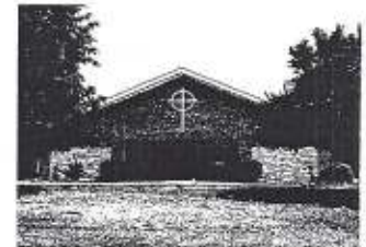
Holy Trinity - Cherry