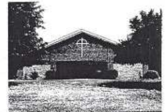
Holy Trinity - Cherry