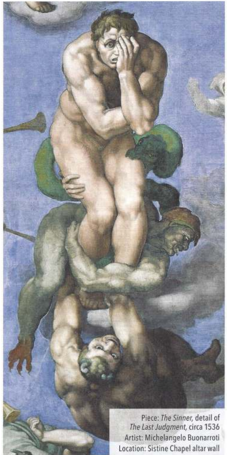
Piece: The Sinner , detail of The Last Judgment , circa 1536 Artist: Michelangelo Buonarroti Location: Sistine Chapel altar wall

"You shall not hate any of your kindred in your heart... Take no revenge and cherish no grudge against your own people. You shall love your neighbor as yourself" (Leviticus 19:17-18).