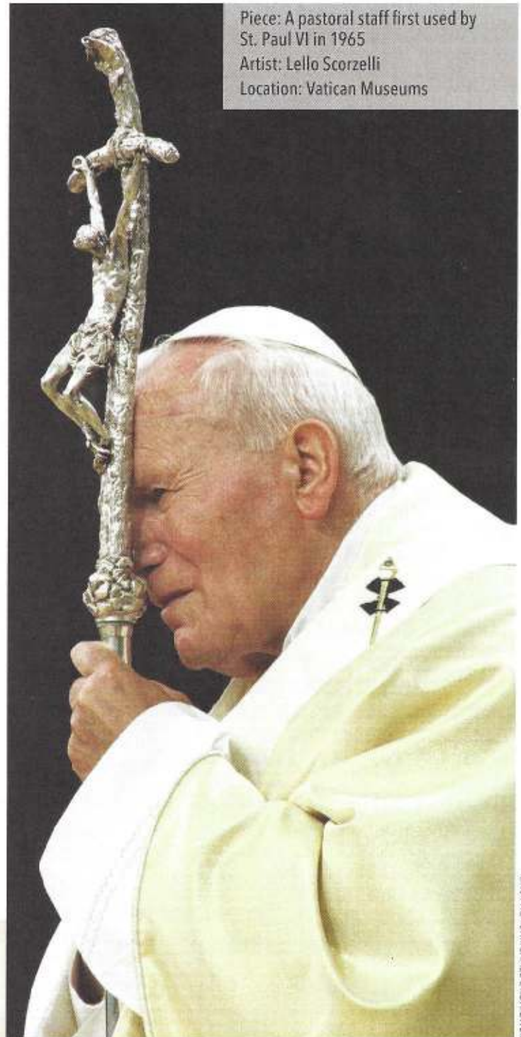
Piece: A pastoral staff first used by St. Paul VI in 1965

Do I believe in the patience and love of Christ on the cross as the best show of strength?