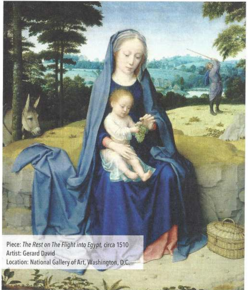
Piece: The Rest on The Flight into Egypt , circa 1510

God loves us so much, like a mother loves her child. He provides for all his creatures, even for the lily that only blooms for a day. He knows everything