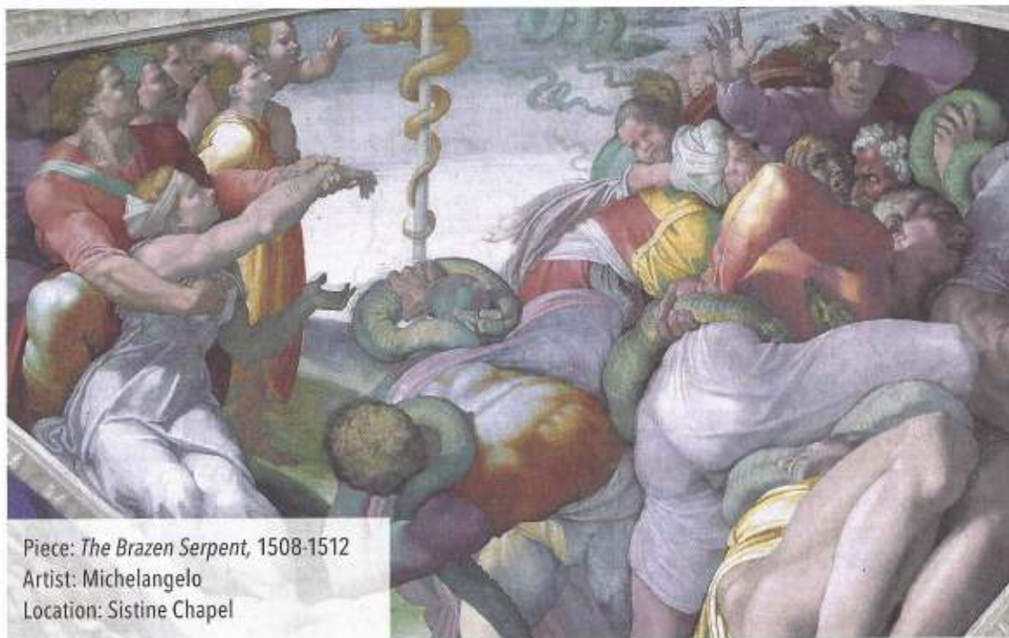
Piece: The Brazen Serpent , 1508-1512

Do I need to repent from whatever attitudes or actions distance me from that love?