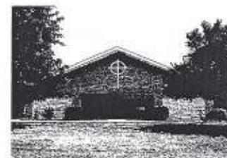
Holy Trinity - Cherry