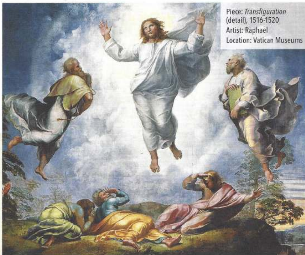
Piece: Transfiguration (detail), 1516-1520 Artist: Raphael Location: Vatican Museums

What area of your life or heart does Jesus want to transfigure into a brighter testimony for him? All light comes from energy consumed and transformed. How does that truth apply to your spiritual life?