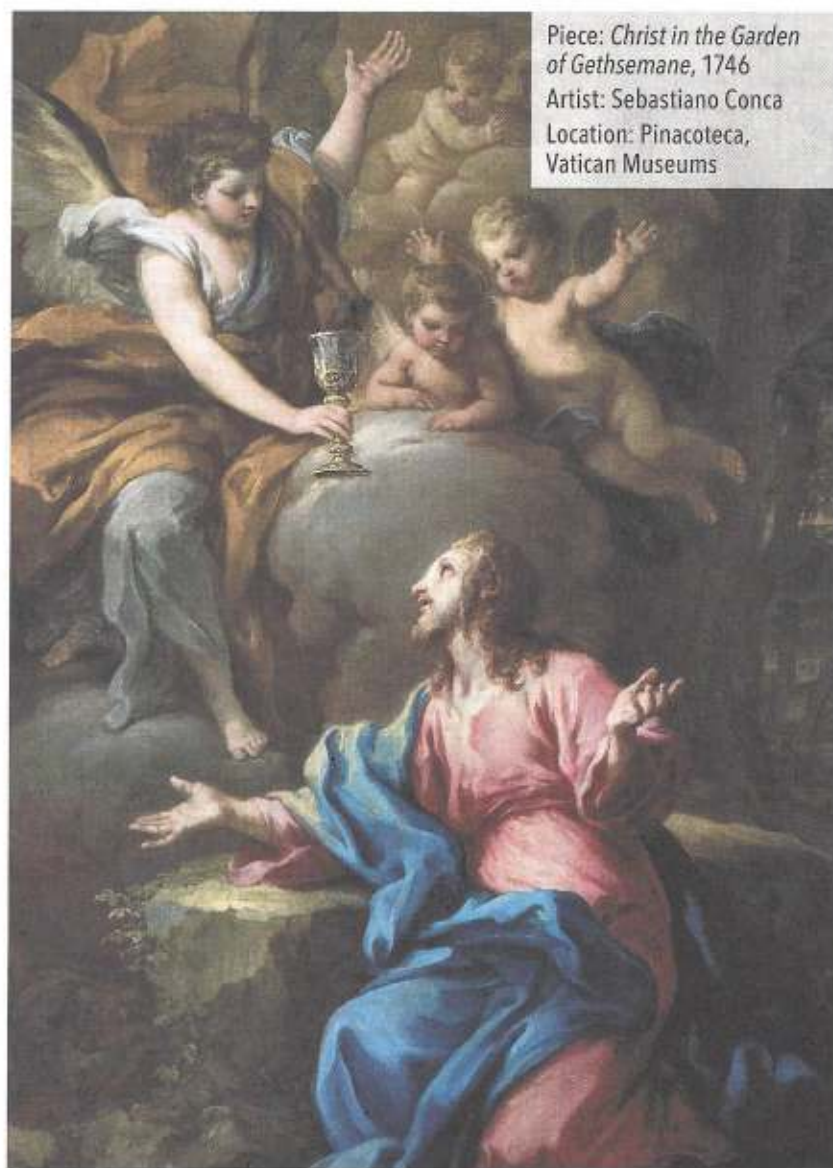
Piece: Christ in the Garden of Gethsemane , 1746 Artist: Sebastiano Conca Location: Pinacoteca, Vatican Museums