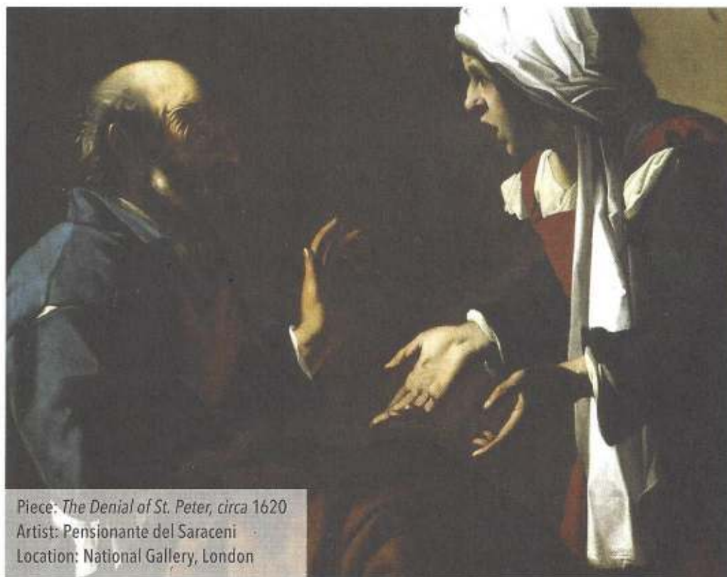
Piece: The Denial of St. Peter , circa 1620 Artist: Pensionante del Saraceni Location: National Gallery, London