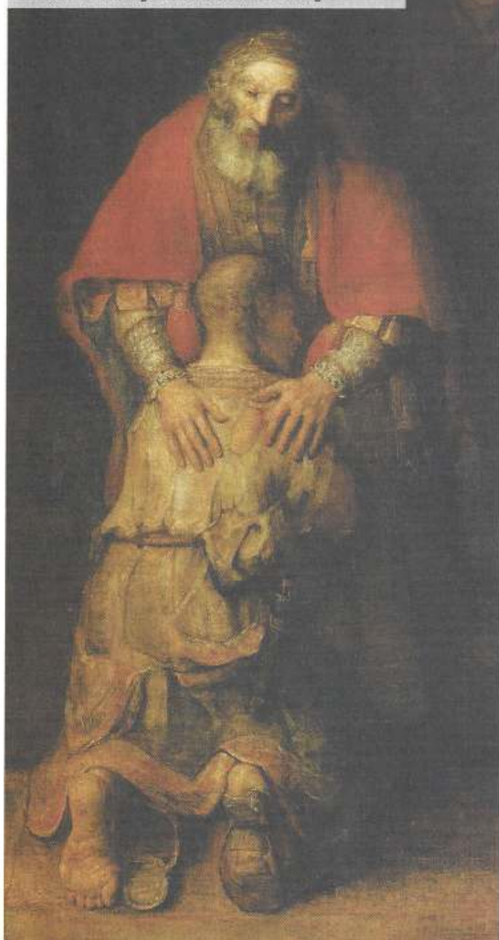
REMBRANDT VAN RIJN/RETURN OF THE PRODIGAL SON

Location: Hermitage Museum, St. Petersburg