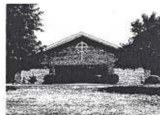
Holy Trinity - Cherry