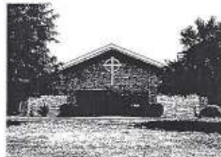
Holy Trinity - Cherry