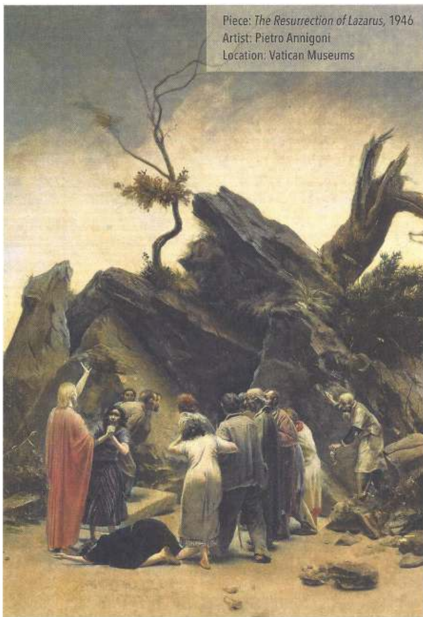
Piece: The Resurrection of Lazarus , 1946