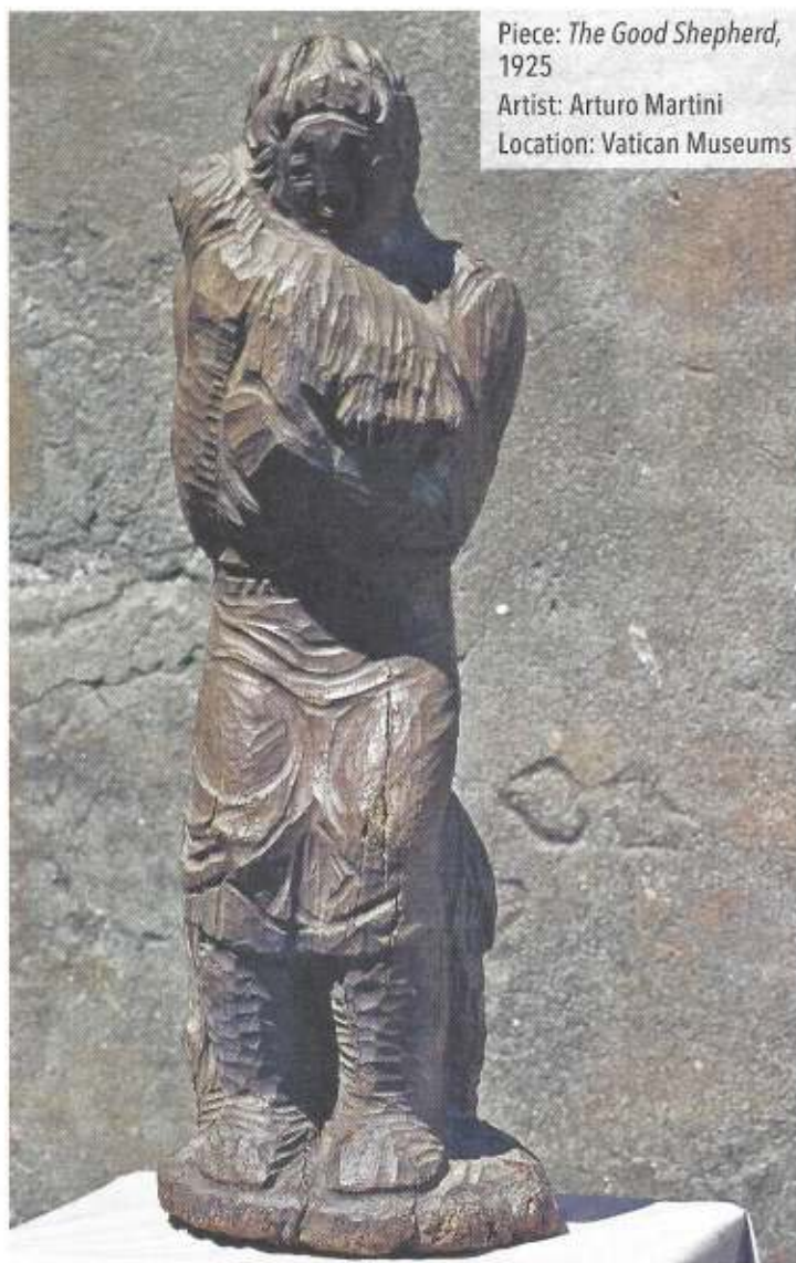
Piece: The Good Shepherd , 1925