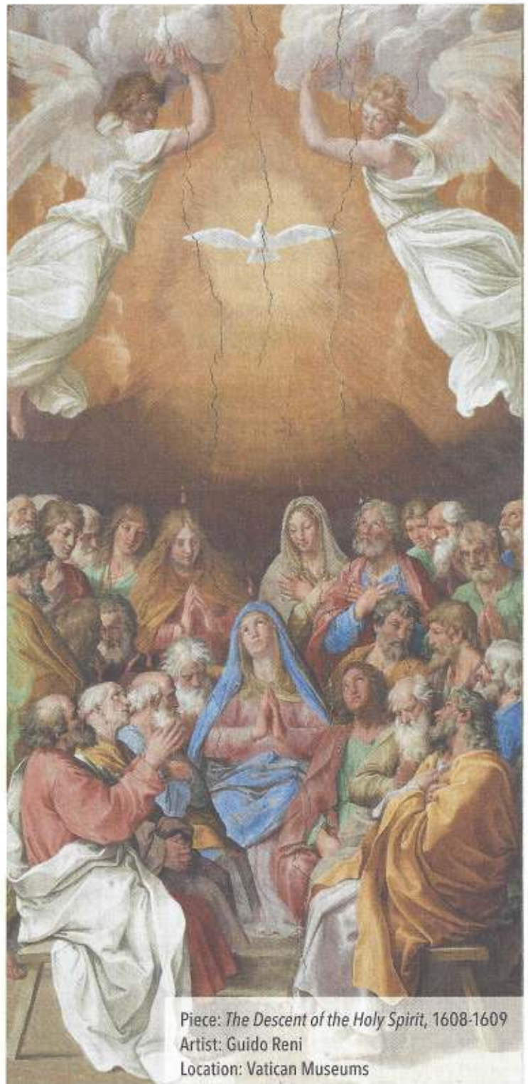
Piece: The Descent of the Holy Spirit , 1608-1609 Artist: Guido Reni Location: Vatican Museums