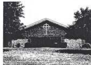
Holy Trinity - Cherry