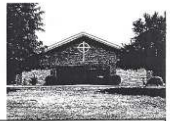
Holy Trinity - Cherry