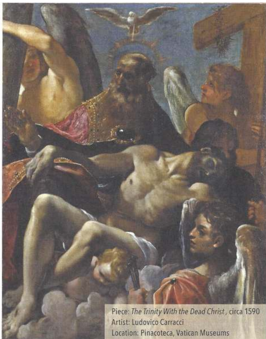
Piece: The Trinity With the Dead Christ , circa 1590

Which person of the Trinity do I most easily relate to—the Father, Son, or Holy Spirit?