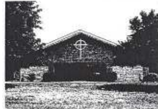
Holy Trinity - Cherry