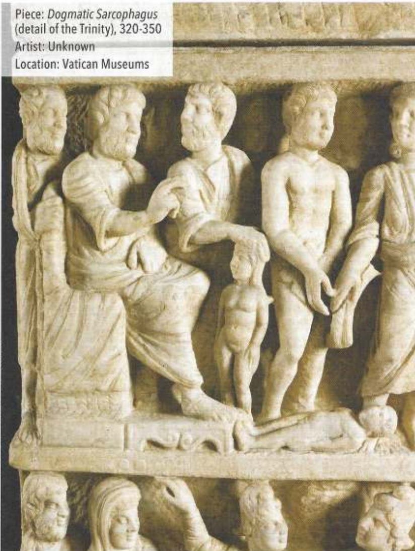
Location: Vatican Museums