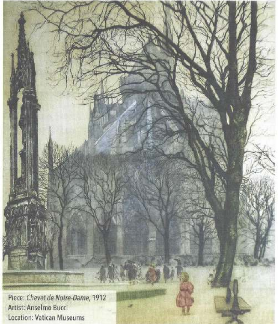
Piece: Chevet de Notre-Dame, 1912

The same can be said of the Church, Christ's kingdom of love. Christ planted the seed of faith in his apostles and that seed spread and thrived all across Europe. Their faith multiplied and grew until all throughout the world the fruits of their faith are on display as a veritable kingdom of charity: hospitals, universities, soup kitchens, AIDS hospices, shelters for the battered and homeless, retreat centers, chapels, churches, museums, research and rehabilitation centers, religious orders, lay associations, volunteer