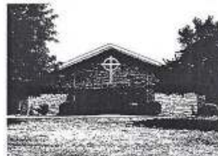
Holy Trinity - Cherry