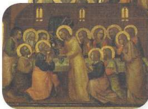
Piece: Stories of the Passion (detail of the Last Supper), circa 1340