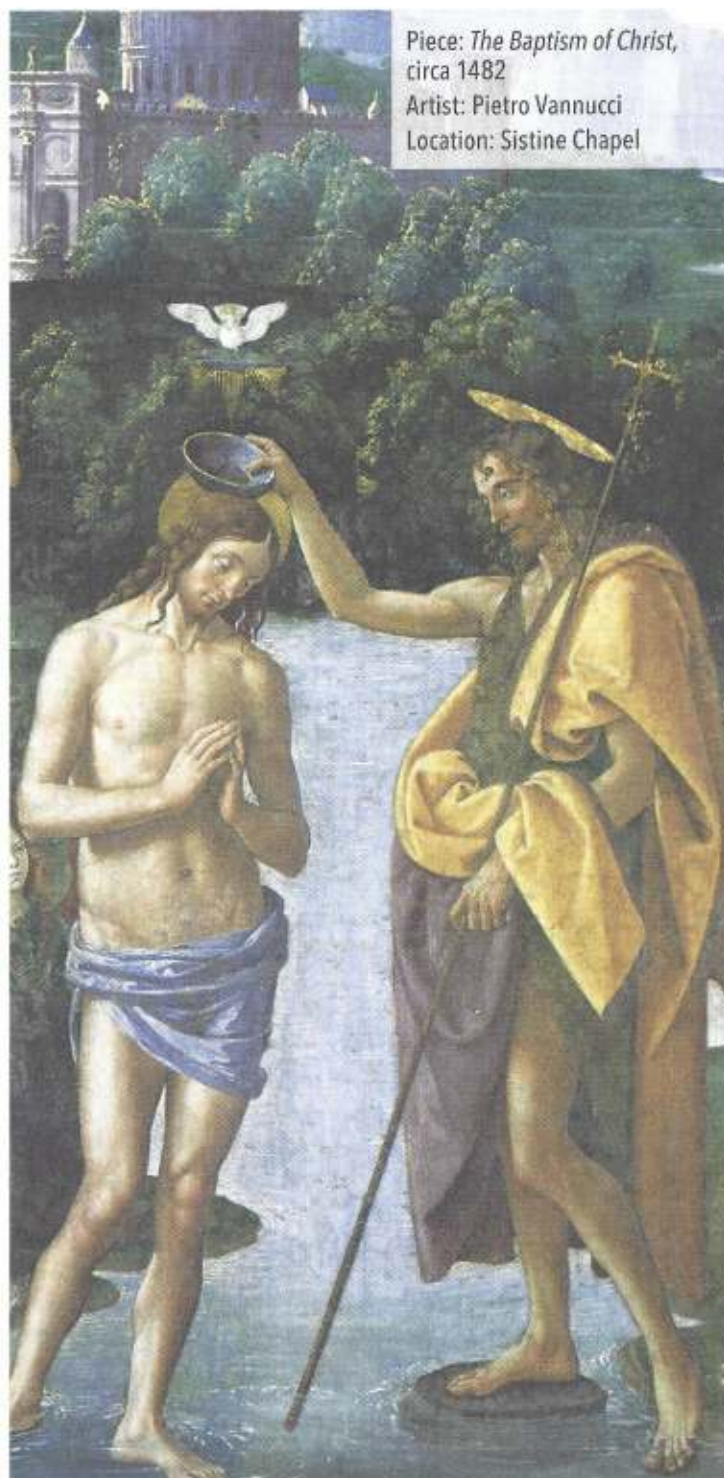
Piece: The Baptism of Christ , circa 1482

How have I benefited from other people who have been generous with their own mission?