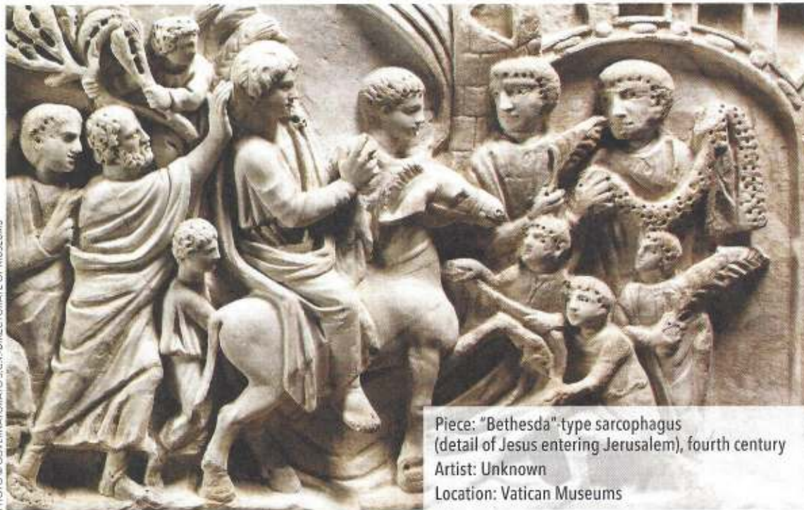
Piece: "Bethesda" type sarcophagus (detail of Jesus entering Jerusalem), fourth century Artist: Unknown Location: Vatican Museums