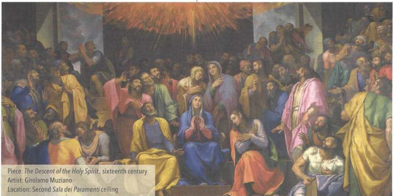
Piece: The Descent of the Holy Spirit , sixteenth century Artist: Girolamo Muziano Location: Second Sala dei Paramenti ceiling

How can I encourage greater unity within my family and parish? Is there a way I can be more of a team player?